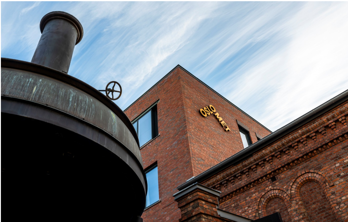
Entrance OsloMet.

https://www.oslomet.no/en/about/events/bobcatsss-2023